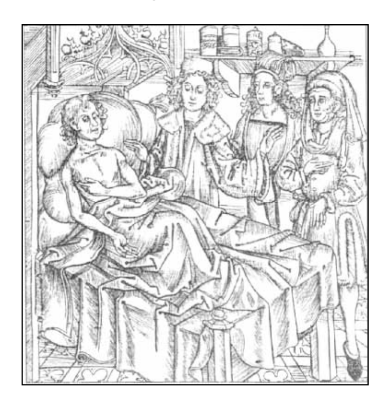
Doctors at the bedside of a plague victim. Hieronymus Brunshwig

Thus, for the countless multitude of men and women who fell sick there remained no support except the charity of their friends (and these were few) or the avarice of servants, who worked for inflated salaries . . . And since the sick were abandoned by their neighbors, their parents, and their friends and there was a scarcity of servants, a practice that was almost unheard of before spread through the city: when a woman fell sick, no matter how attractive or beautiful or noble she might be, she did not mind having a manservant (whoever he might be, no matter how young or old he was), and she had no shame whatsoever in revealing any part of her body to him—the way she would have done to a woman—when the necessity of her sickness required her to do so. This practice was, perhaps, in the days that followed the pestilence, the cause of looser morals in the women who survived the plague. . . .