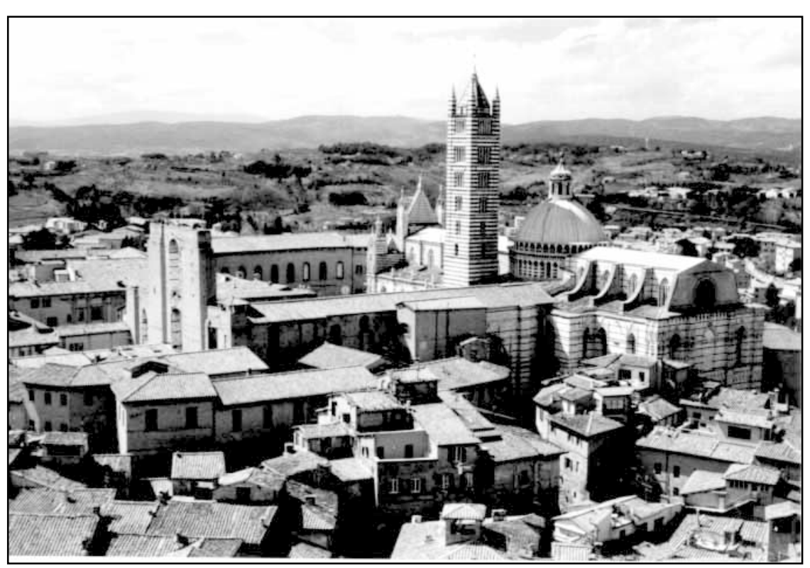
The Cathedral of Siena, Itlay

gnolo di Tura was a chronicler who lived in Siena, a city of about 60,000 located some thirty miles south of Florence. In 1347, it was a great banking center and wealthy enough to be building what the citizens intended to be the greatest church in Christendom. Siena was very hard hit by the Black Death. Di Tura, who survived it though all his family died, claimed that after the plague had passed, only 10,000 people remained alive. The records do not allow us to know exact figures, but certainly there is evidence that the city suffered unusually high losses. Construction work on the cathedral was halted and never resumed. Both the university and the wool-processing industry closed down. Laymen filled posts usually reserved for clergymen because so many priests died. Many estates, left with no heirs at all, were taken over by a much-reduced city council. The civil courts ceased to meet. When recovery set in, the authorities acted quickly to identify taxpayers that remained and to impose a new tax in