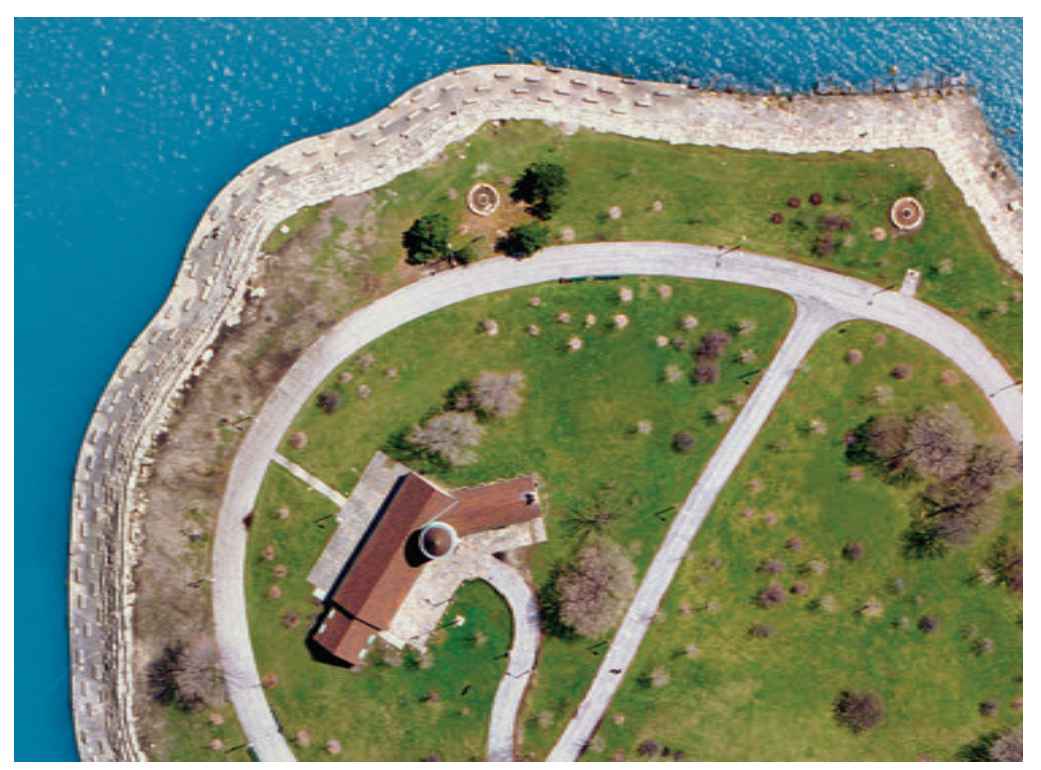
A view from directly above looks straight down.