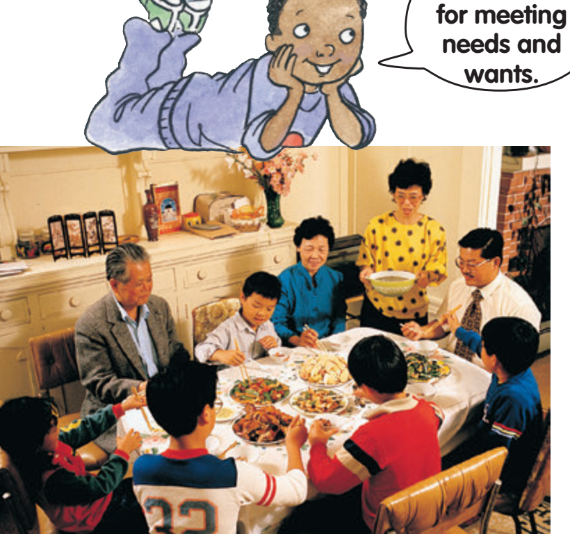
B We need food for our health.

This neighborhood has things people need. It also has things they want.