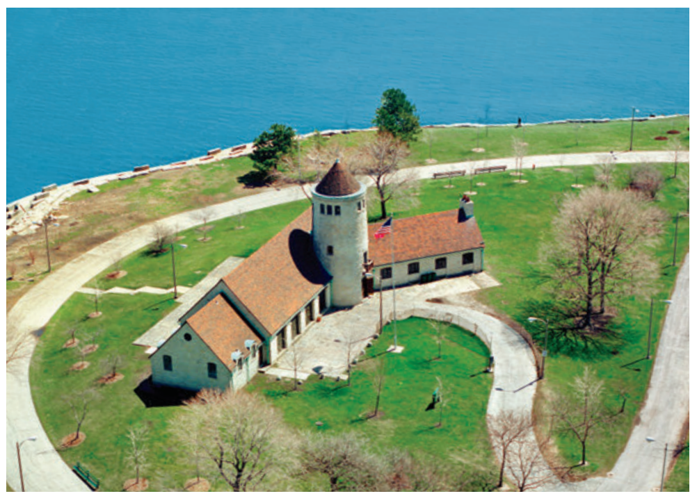
B A bird's-eye view looks down at an angle.