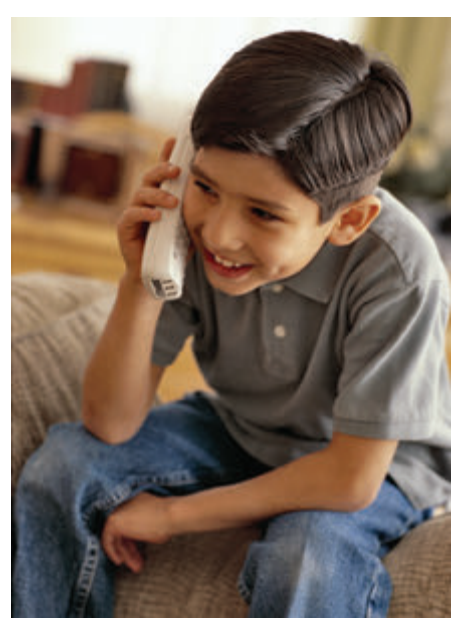
We need ways to communicate with others.