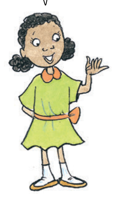
D A map is a special drawing of a view from directly above.

How is the map DIFFERENT from the photo?